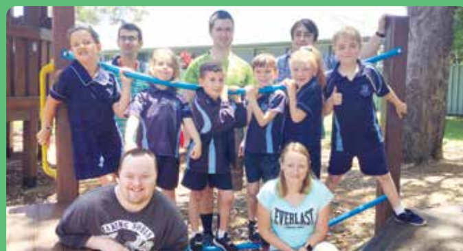
Anna Bay Year 1 students with their Lifestyle Buddies .

The Port Stephens Community Hub is looking into expanding their Lifestyle Buddies program and hopes to get other local schools on board for next year.