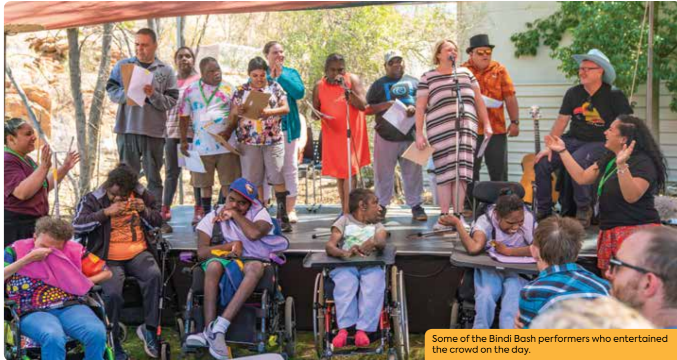
Some of the Bindi Bash performers who entertained the crowd on the day.

Bindi Enterprises is committed to supporting people to achieve the best in life skills, training, professional and purposeful opportunities that are equal and celebrate ability.